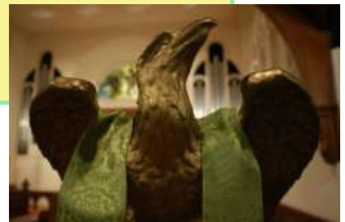
On Easter the stole on the ambo will change to White. In this picture it is green, signifying "Ordinary Time."